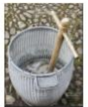
dolly and tub